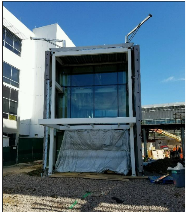
CON south vestibule curtain wall install complete.