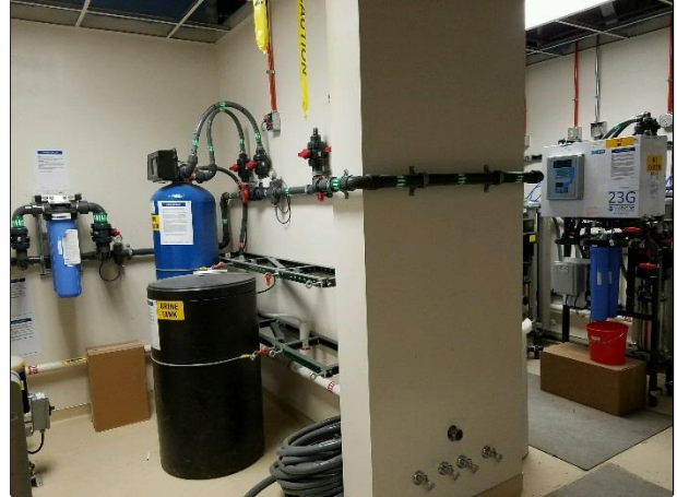
Water treatment equipment for Dialysis Area in CBN.