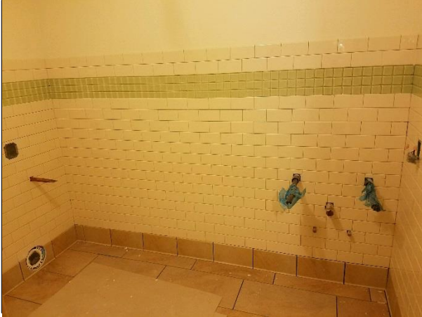
Tile installed in ENC locker rooms.