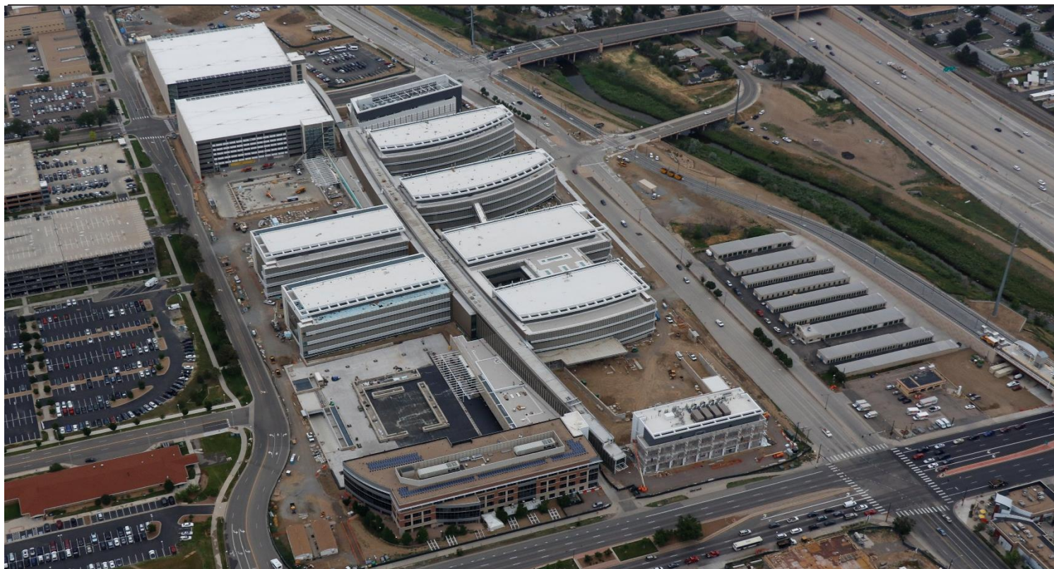
Aerial of the full site facing northeast taken on July 1, 2016.