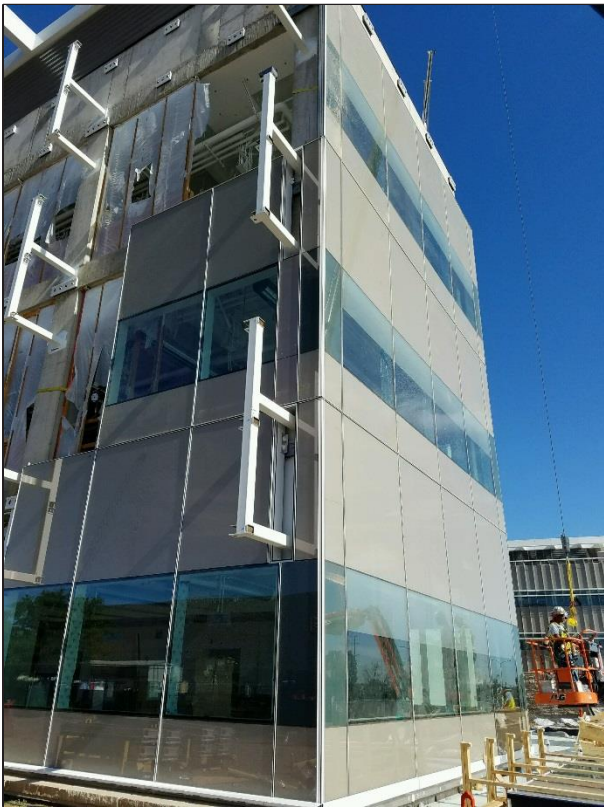
RES curtain wall panel installation.