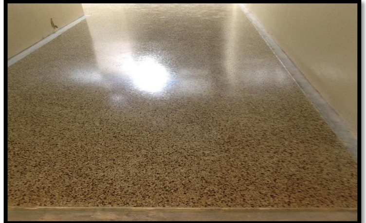
• Concourse- Terrazzo Flooring