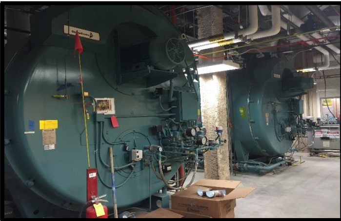
• Energy Center- Boiler System Energized