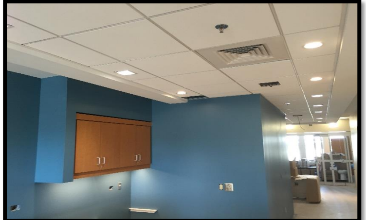
• Inpatient Buildings- IBS Work Station