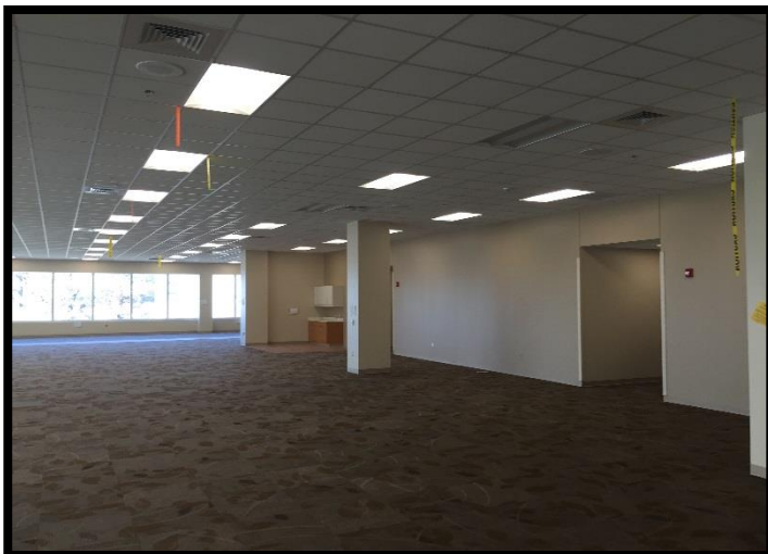
• CBN - Level 2