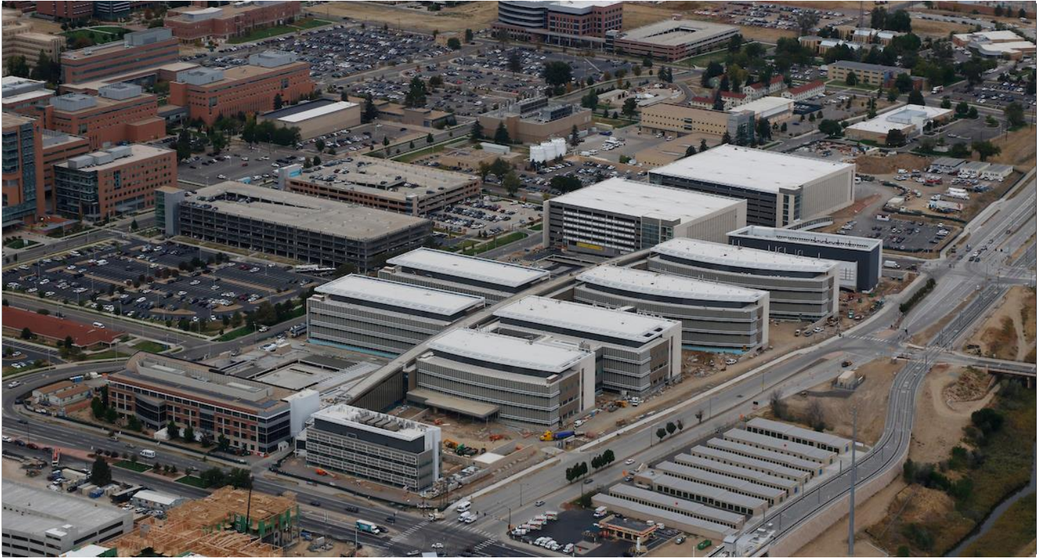
Aerial of the full site facing northwest taken on October 1, 2016. 78% Complete.