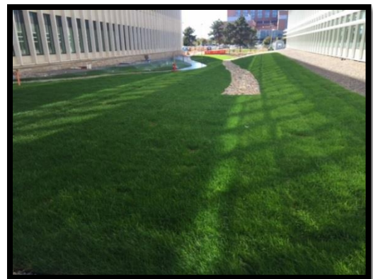
• Site-CB Courtyard